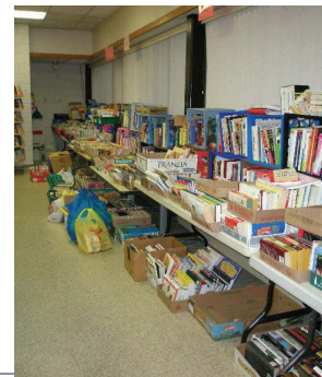
Children's book row @ the fall book sale

For more information about donating your time or money to the library, visit our website at www.roxburylibrary.org/friends . Most importantly please join the Friends today!